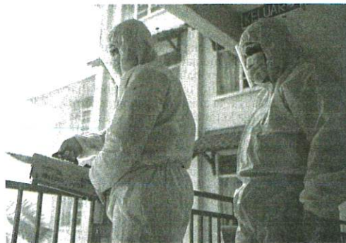
KERJA-KERJA penyemburan cecair pembasmi kuman di kolej kediaman pelajar Unisza di Kuala Terengganu, baru-baru ini.

PENULIS ialah Koresponden Utusan Malaysia Terengganu.