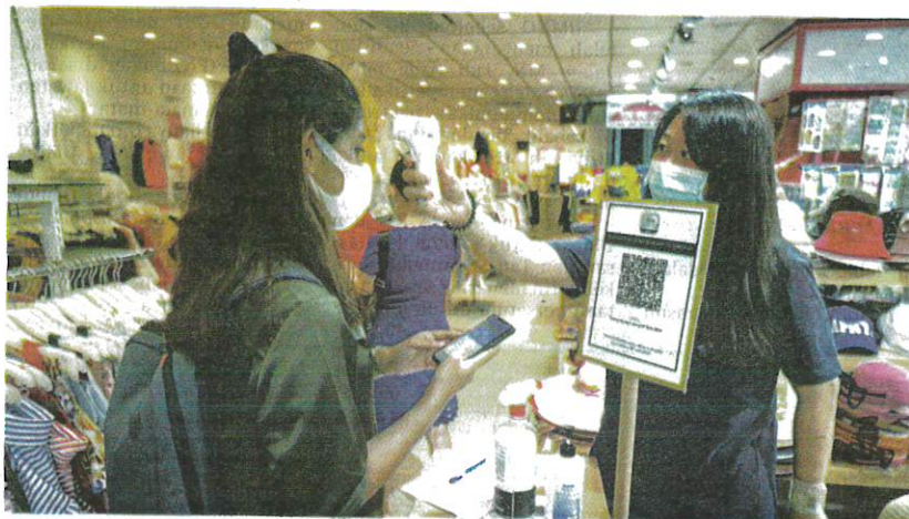
SEORANG pelanggan menggunakan aplikasi MySejahtera sebelum memasuki sebuah pasar raya di Jalan Bukit Bintang, Kuala Lumpur baru-baru ini.

Noor Hisham berkata, terdapat enam kluster terbaharu yang dilaporkan sejak 11 Oktober iaitu