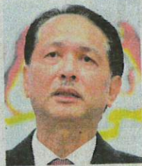
DR NOOR HISHAM

Beliau berkata, berikutan kepadatan penduduk dan kadar pergerakan penduduk tinggi, Selangor terus mencatatkan pertambahan kes dan kluster ba-