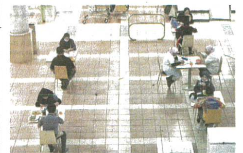
PENIAGA kedai makan dan pelanggan mematuhi SOP di medan selera di sebuah kompleks membeli-belah.

Kuala Lumpur: Semua pekerja sektor awam dan swasta peringkat pengurusan serta pentadbiran dalam kawasan Perintah Kawalan Pergerakan Bersyarat (PKPB) diarah bekerja di rumah mulai esok. Menteri Kanan (Keselamatan), Datuk Seri Ismail Sabri Yaakob berkata, ia membabitkan sejuta pekerja di Wilayah Persekutuan Kuala Lumpur, Putrajaya dan Selangor. Menurutnya, keputusan itu dibuat menerusi Sidang Khas Majlis Keselamatan Negara (MKN) yang dipengerusikan Perdana Menteri, Tan Sri Muhyiddin Yassin selepas mengendera pembentangan Kementerian Kesihatan Malaysia (KKM) mengenai peningkatan kes jangkitan Covid-19 membabitkan pekerja di pejabat. "Terdapat sembilan kluster dari tempat kerja di negeri Selangor sehingga hari ini (semalam). "Justeru, pekerja bagi sektor awam dan swasta di peringkat pengurusan serta pengawasan tidak perlu ha-