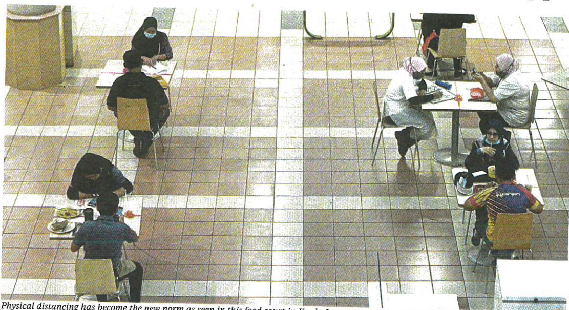
Physical distancing has become the new norm as seen in this food court in Kuala Lumpur yesterday.

"Viral load depends on virus genotype and the body's response to the virus. Anyone can be a superspreader if the condi-