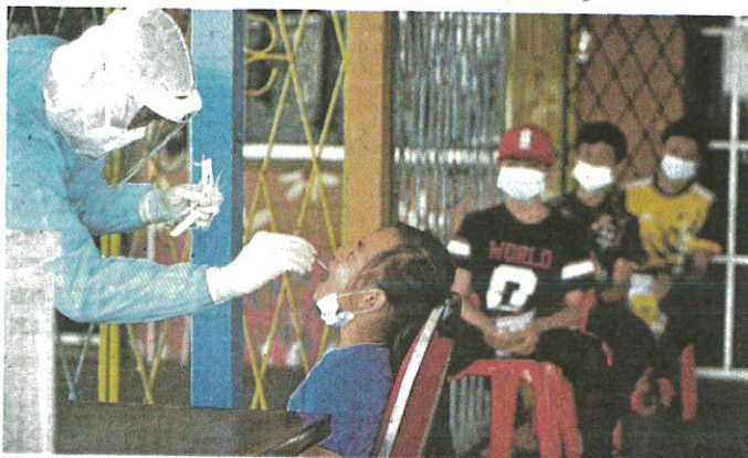
PELAJAR SMK Pantai menjalani ujian saringan Covid-19 di Klinik Kesihatan Membedai, semalam.