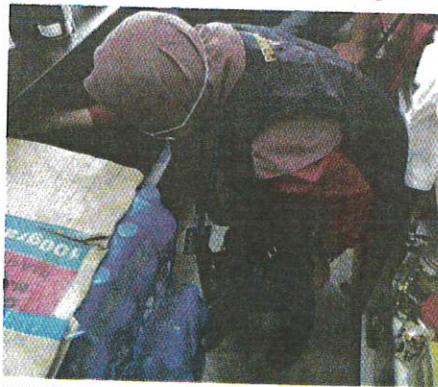
PEGAWAI BPF JKNS melakukan pemeriksaan terhadap sebuah premis menjual ubat resdung haram.