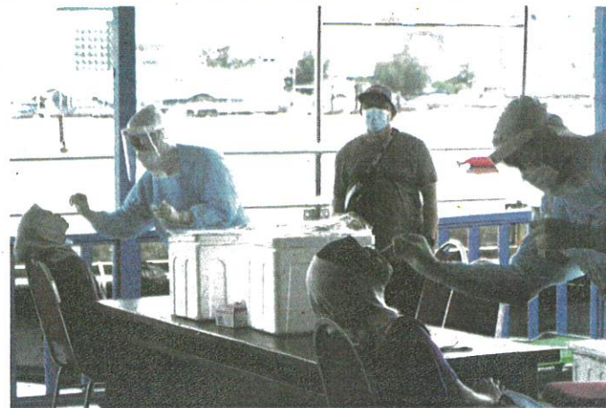
PENDUDUK di Kampung Patau-Patau 1 melakukan ujian calitan.