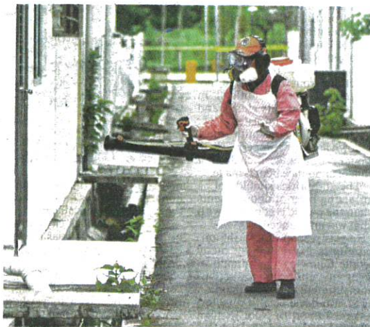
A Klang Municipal Council worker sanitising a row of houses at Taman Ehsan Jaya in Pandamaran, Klang, yesterday.

He said the first cluster reported in Selangor, also the country's third wave, was the Jalan Apas