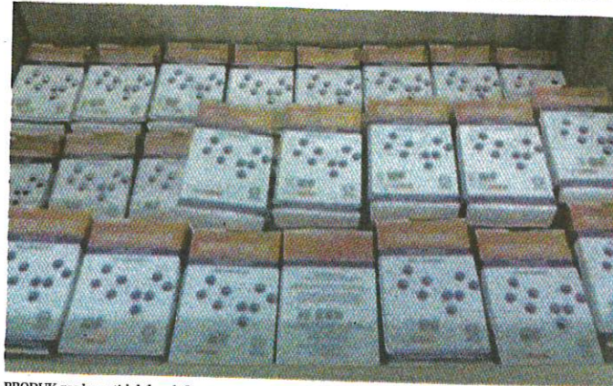
PRODUK resdung tidak berdaftar yang dirampas BPF JKNS.